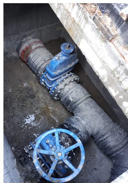
Mining - POLAND