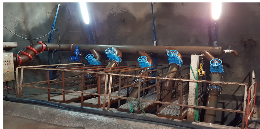
Tunnel EURALPIN - FRANCE