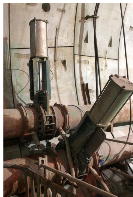
Tunnel - ITALY